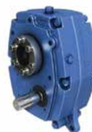
Helical Shaft Mount Reducer

Request a Quick-Build Product – email : sumitomo@motion.co.nz