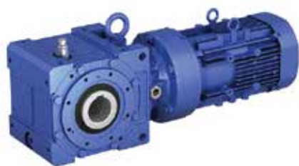
Bevel BuddyBox® 4 Gearmotor

This is our commitment to you. If your product is eligible for a quick build, and we fail to meet our commitment, we will waive any additional fees and pay the freight to get you your unit quickly. With a greater than 97% on-time delivery within our quick build program, we are confident we will live up to our promise.