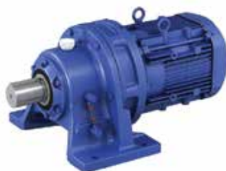
Cyclo® Drive Gearmotor